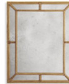
GEORGIAN - SMALL

61 x 110cm / 24 x 43¼" See page 22-23, 5