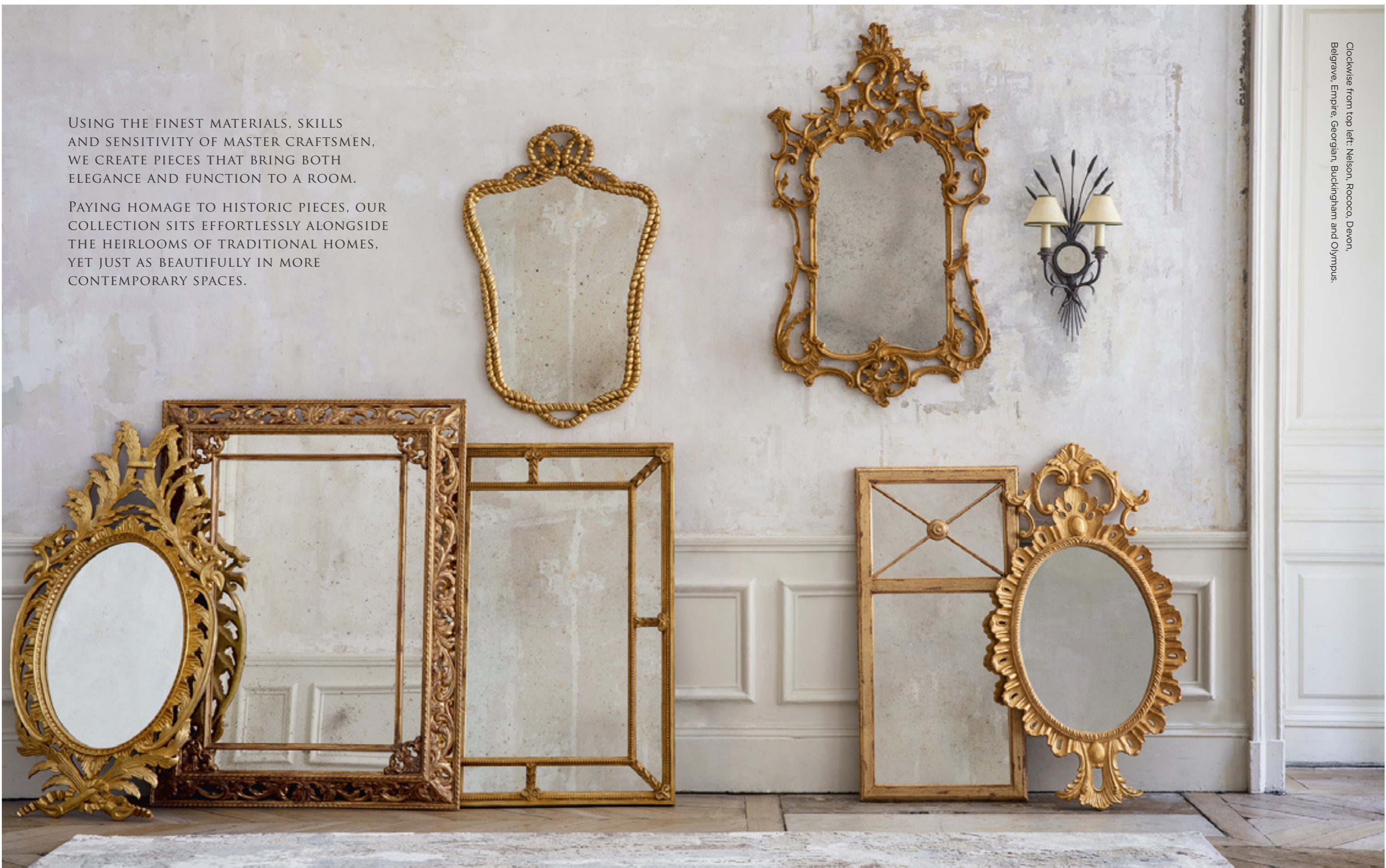
Clockwise from top left: Nelson, Rococo, Devon, Belgrave, Empire, Georgian, Buckingham and Olympus.

PAYING HOMAGE TO HISTORIC PIECES, OUR COLLECTION SITS EFFORTLESSLY ALONGSIDE THE HEIRLOOMS OF TRADITIONAL HOMES, YET JUST AS BEAUTIFULLY IN MORE CONTEMPORARY SPACES.