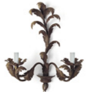
VERONA - 2 BRANCH

43 x 37cm / 17 x 14½" See page 96-97, 77