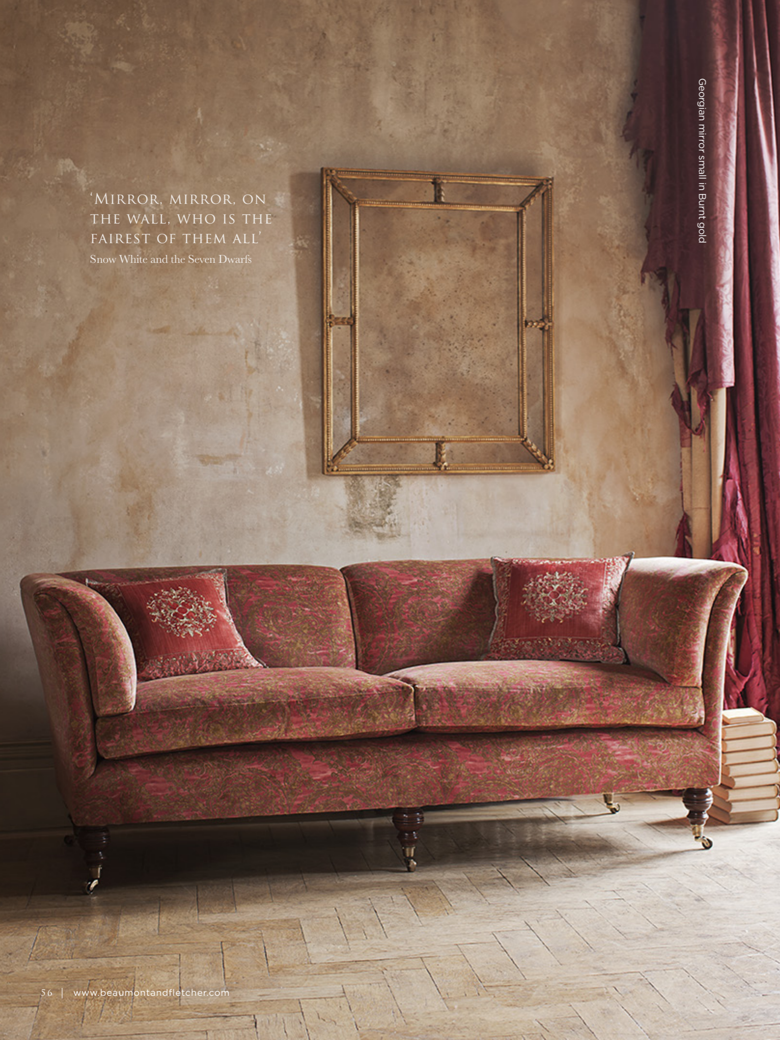
Georgian mirror small in Burnt gold