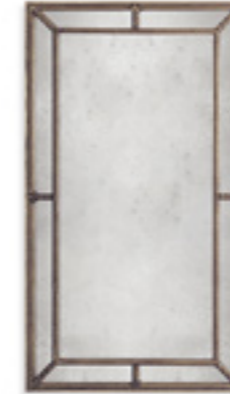
GEORGIAN - MEDIUM

84 x 107cm / 33 x 42¼" Bespoke sizes available See page 54-57, 5, 19, 20, 66