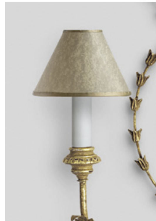
LARGE H10 x ø14cm / H4 x ø5.5"