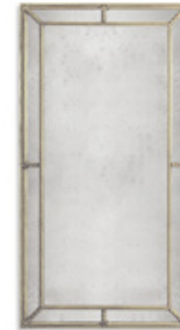
GEORGIAN - LARGE

90 x 160cm / 35½ x 63" Bespoke sizes available See page 54-57