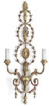
ADAM - SMALL

30.5 x 77.5cm / 12 x 30½" See page 8-9, 50