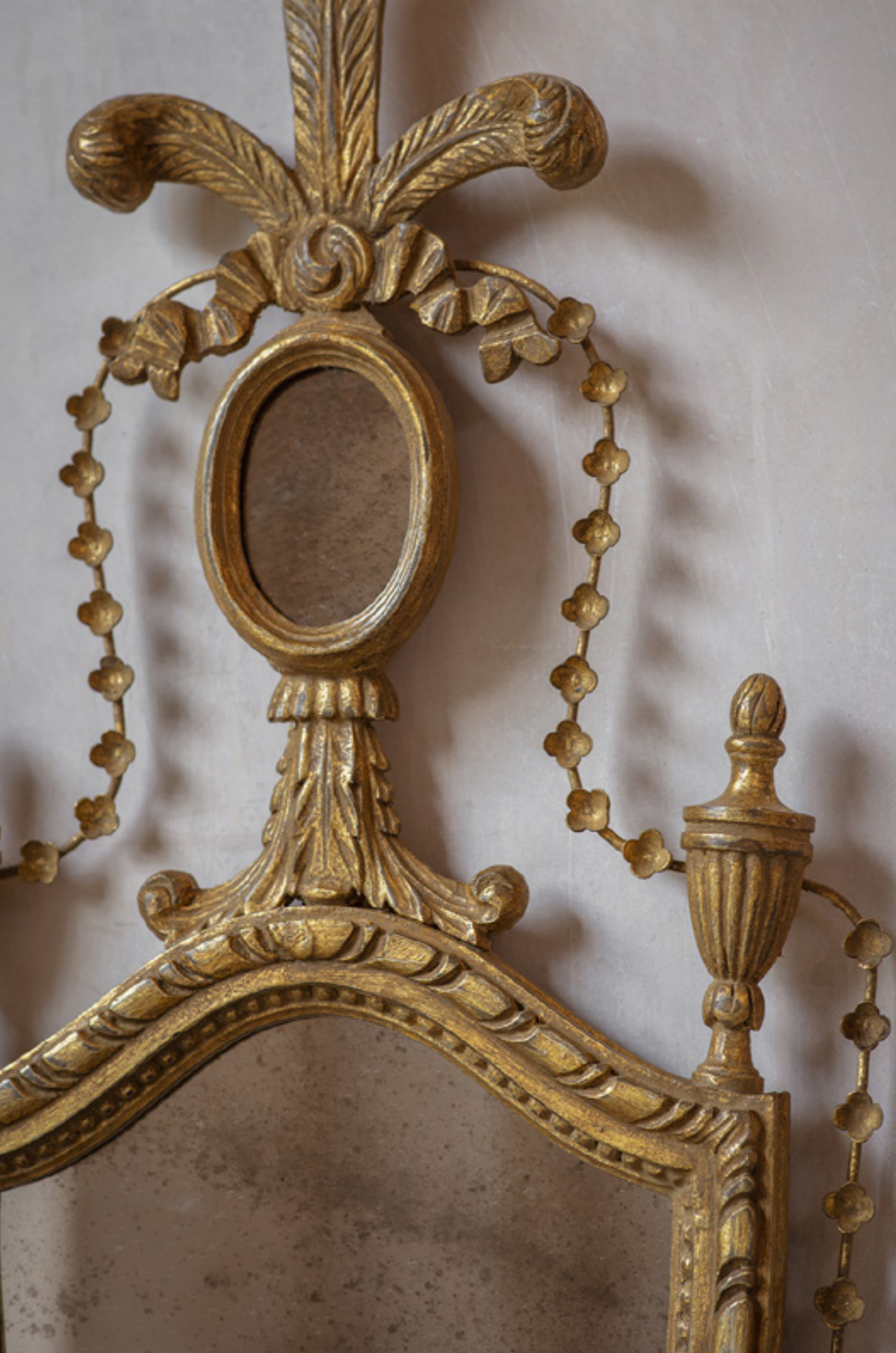
Catherine mirror shown in Burnt gold