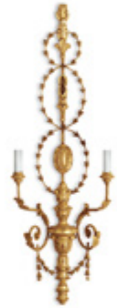
ADAM - LARGE

30.5 x 77.5cm / 12 x 30½" See page 8-9, 50