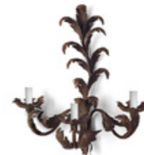
VERONA - 3 BRANCH

38 x 94cm / 15 x 37" Available as right and left facing See page 62-63