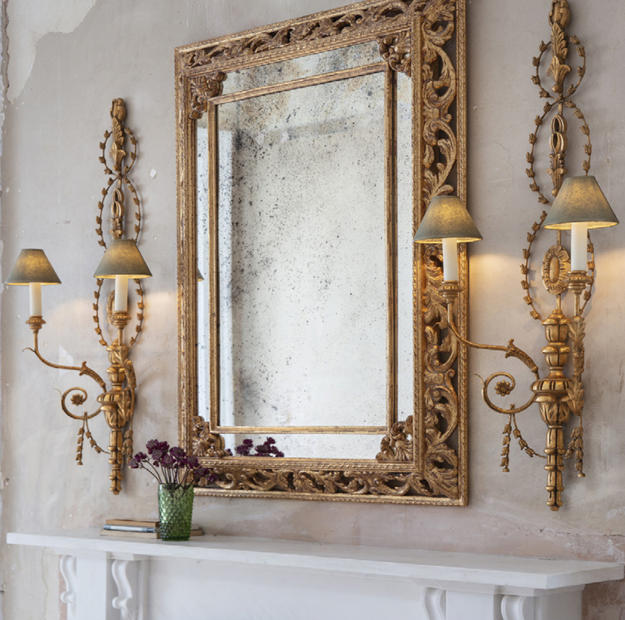
Adam large wall lights shown in Antiqued gold, Buckingham mirror shown in Distressed gold