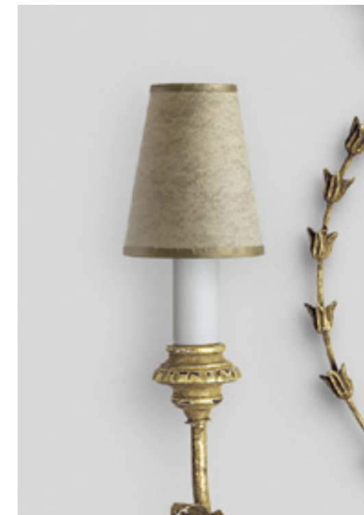
SMALL H11 x ø9cm / H4¼ x ø3½"

Available in two standard sizes, our elegant light shades allow the ornate designs of our decorative lights to shine through.