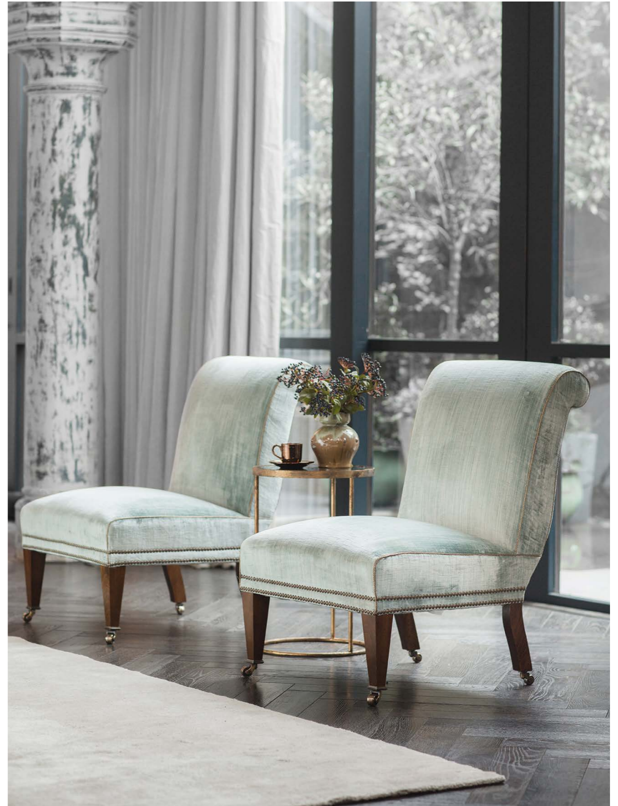
Opposite: Wexford chair in Wicklow damask - Oatmeal