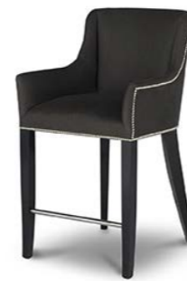
KINGSLEY BAR STOOL

This traditionally upholstered tall stool, with its high back and sloping arms, is designed to provide maximum comfort. It would be a glamorous and welcoming addition to a bar.