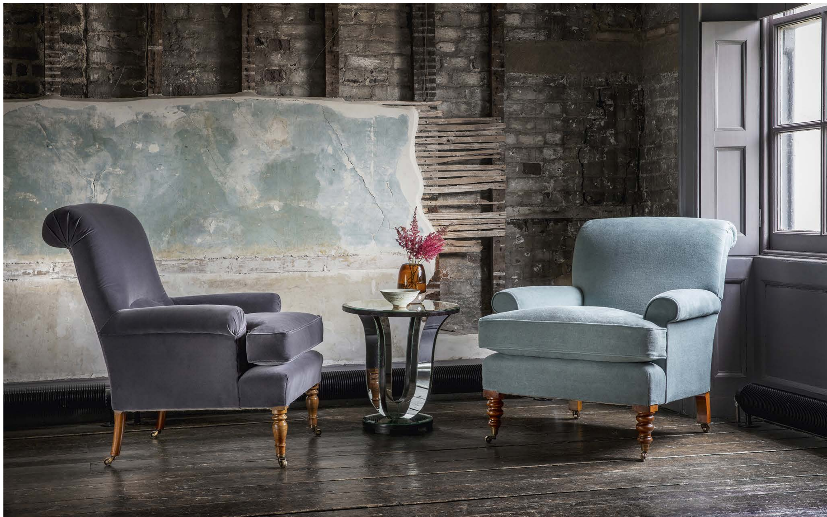
From left: Bennett chair in Zafra cotton velvet - Graphite Hamilton chair in Orkney linen - Spruce Blue