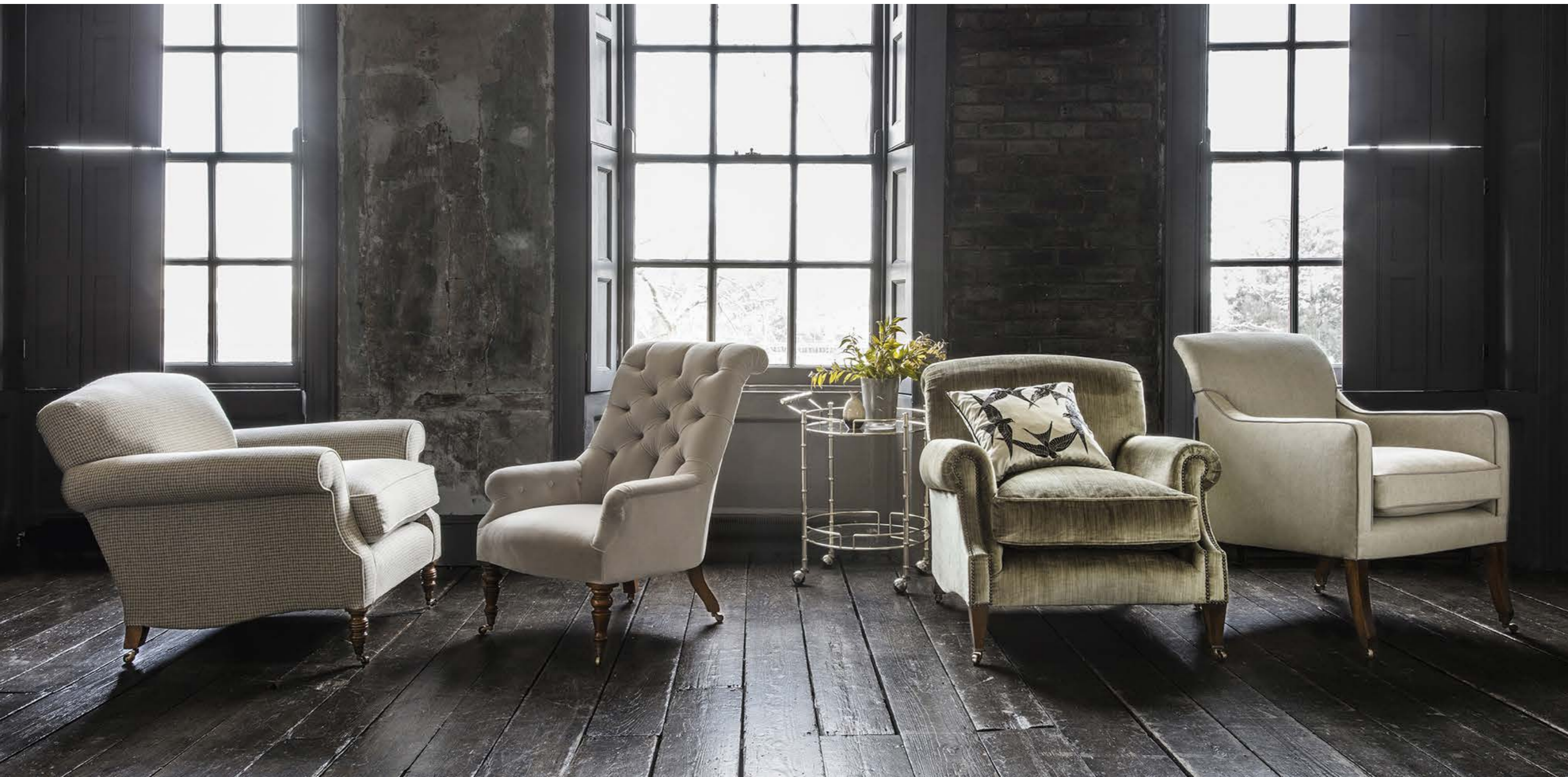
From left: Boswell chair in Argyll Check - Glacier Waterford chair in Zafra cotton velvet - Ecrú Milton chair in Como silk velvet - Fern; with Elvira cushion Compton chair in Orkney linen - Cement