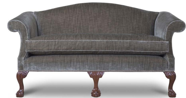
Opposite: Warwick sofa in Como silk velvet - Fern