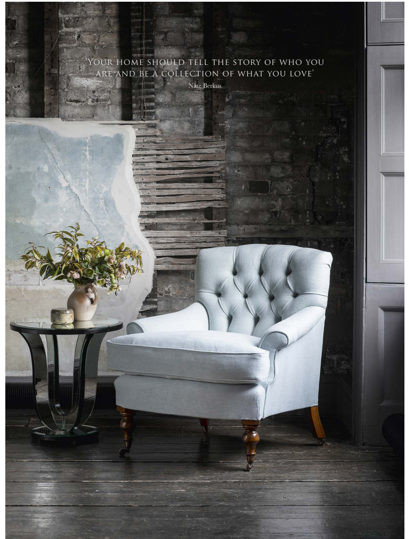
Opposite: Emily chair in Orkney linen - Frost