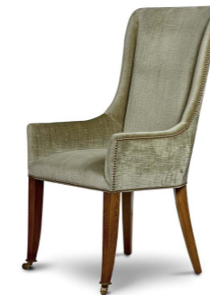
KINGSLEY CARVER CHAIR

The Kingsley carver chair is a signature Beaumont & Fletcher design. Its tall, gently arching back and tapered legs result in its classic English feel. See page 55.