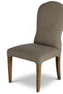
BLAKE SIDE CHAIR

The sister chair to the Blake carver chair. Without the arms but just as elegant. See page 55.