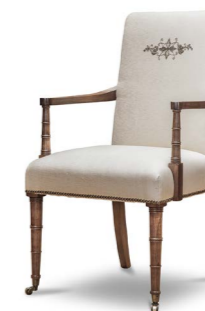
PAVILION CARVER CHAIR

Inspired by the Regency period, this versatile chair can be used as a dining chair or an occasional piece. Choose between turned faux-bamboo legs or plain square carved ones.