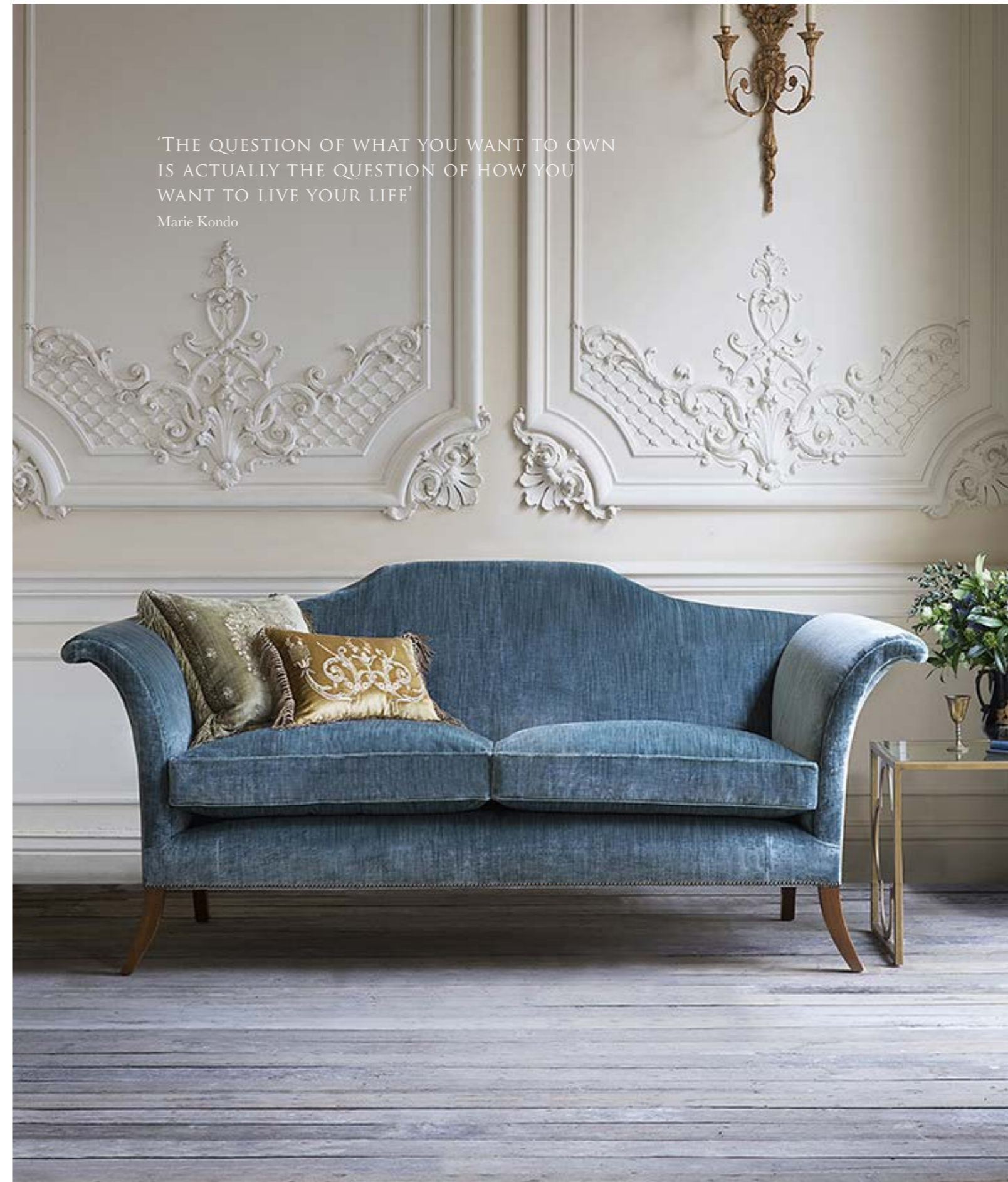
Opposite: Clarence sofa in Como silk velvet - Teal; with Beatrice and Thalia cushions

'THE QUESTION OF WHAT YOU WANT TO OWN IS ACTUALLY THE QUESTION OF HOW YOU WANT TO LIVE YOUR LIFE'