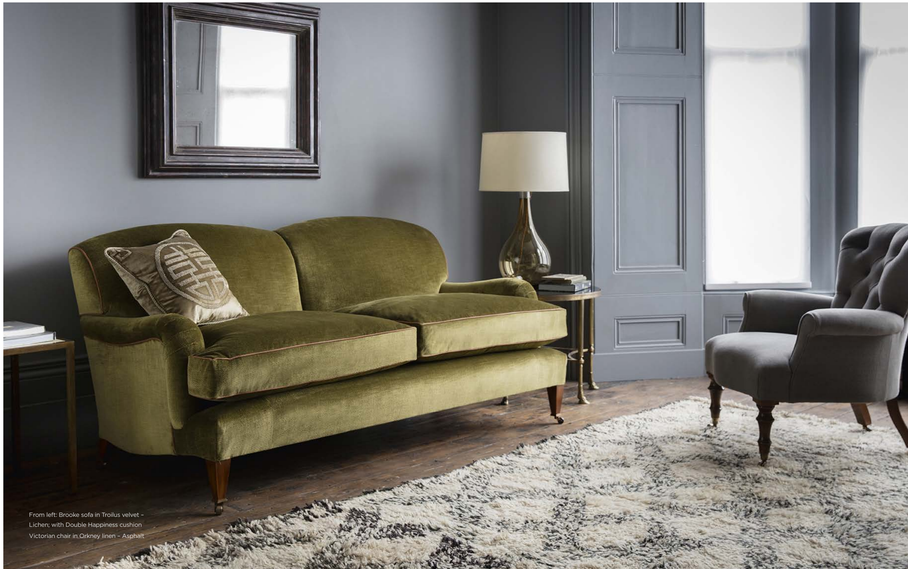
From left: Brooke sofa in Troilus velvet - Lichen; with Double Happiness cushion Victorian chair in Orkney linen - Asphalt