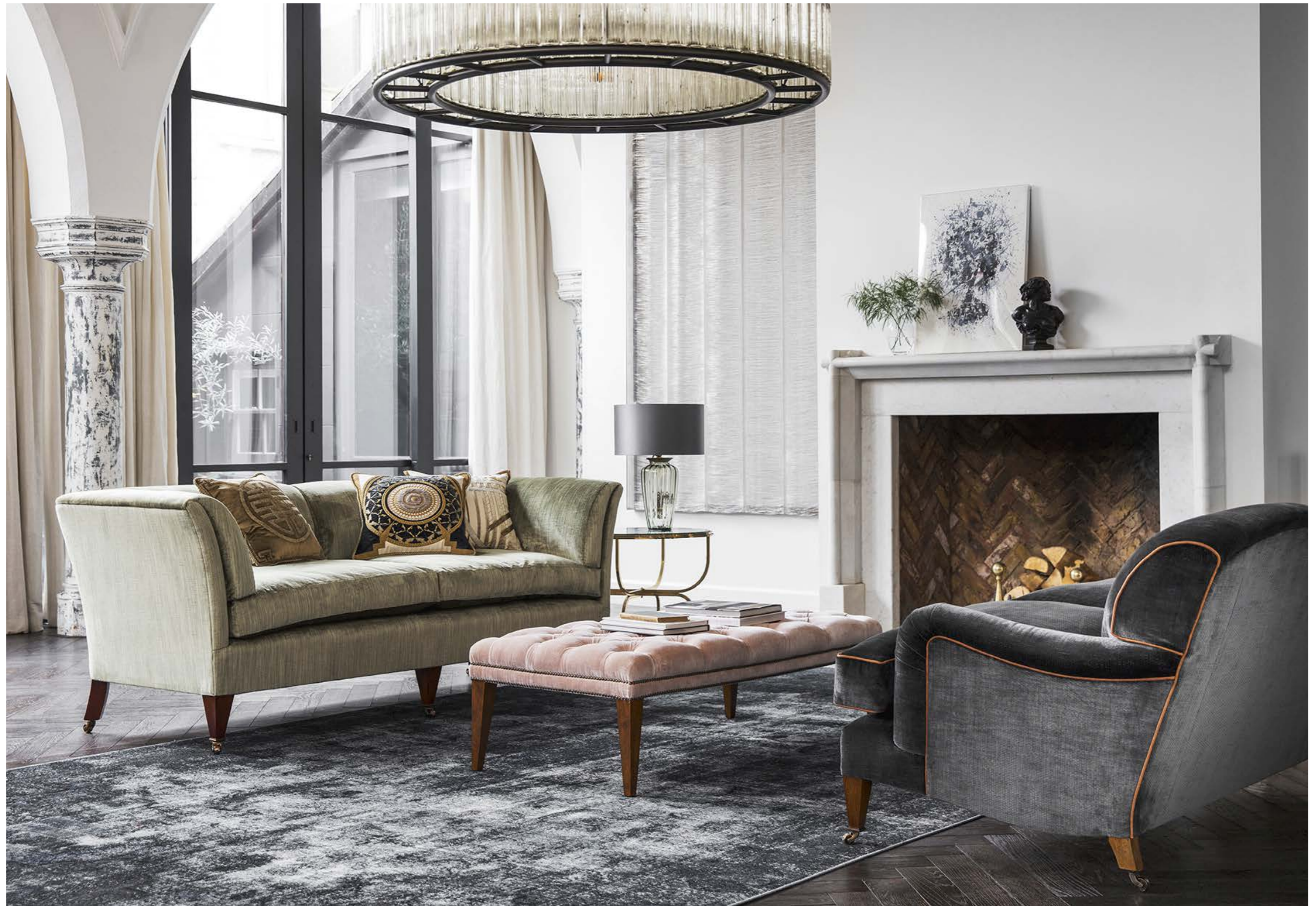
From left: Pompadour High-Back sofa in Como silk velvet - Moss; with Double Happiness, Ettore and Audrey cushions Portia footstool in Capri silk velvet - Blush Brooke sofa in Troilus velvet - Flint Blue