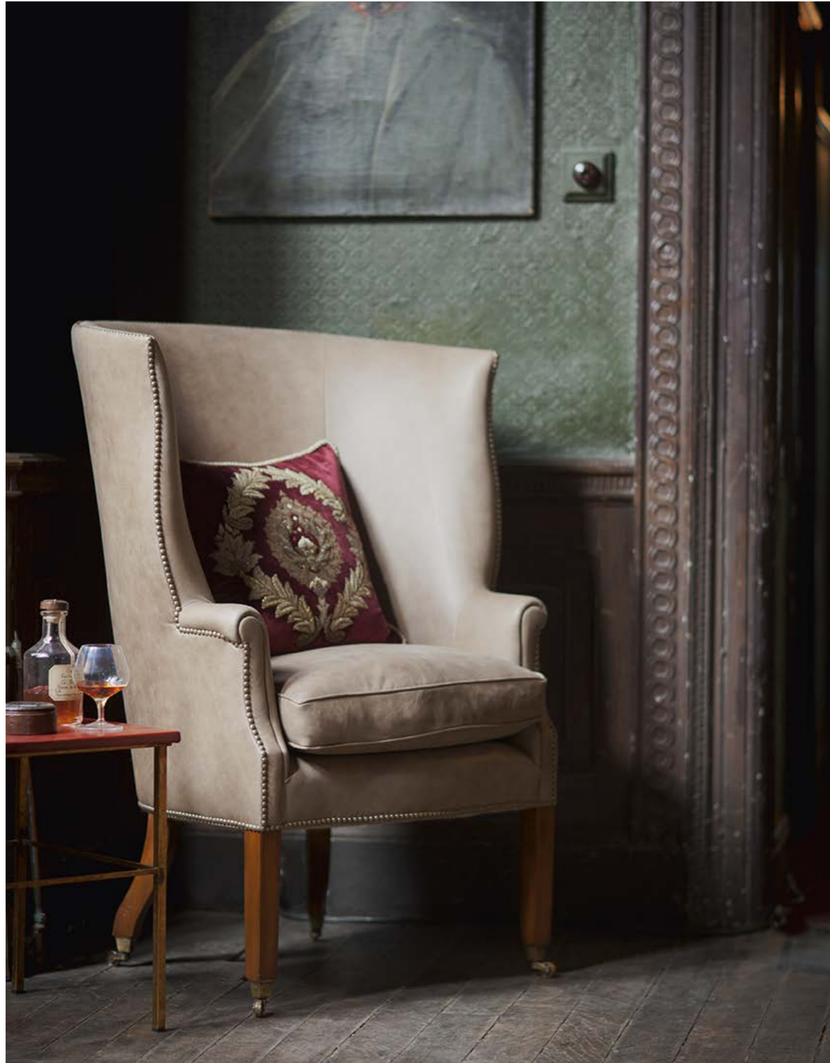
This page: Spencer wing chair in Siena leather - Hare; with Rossini cushion