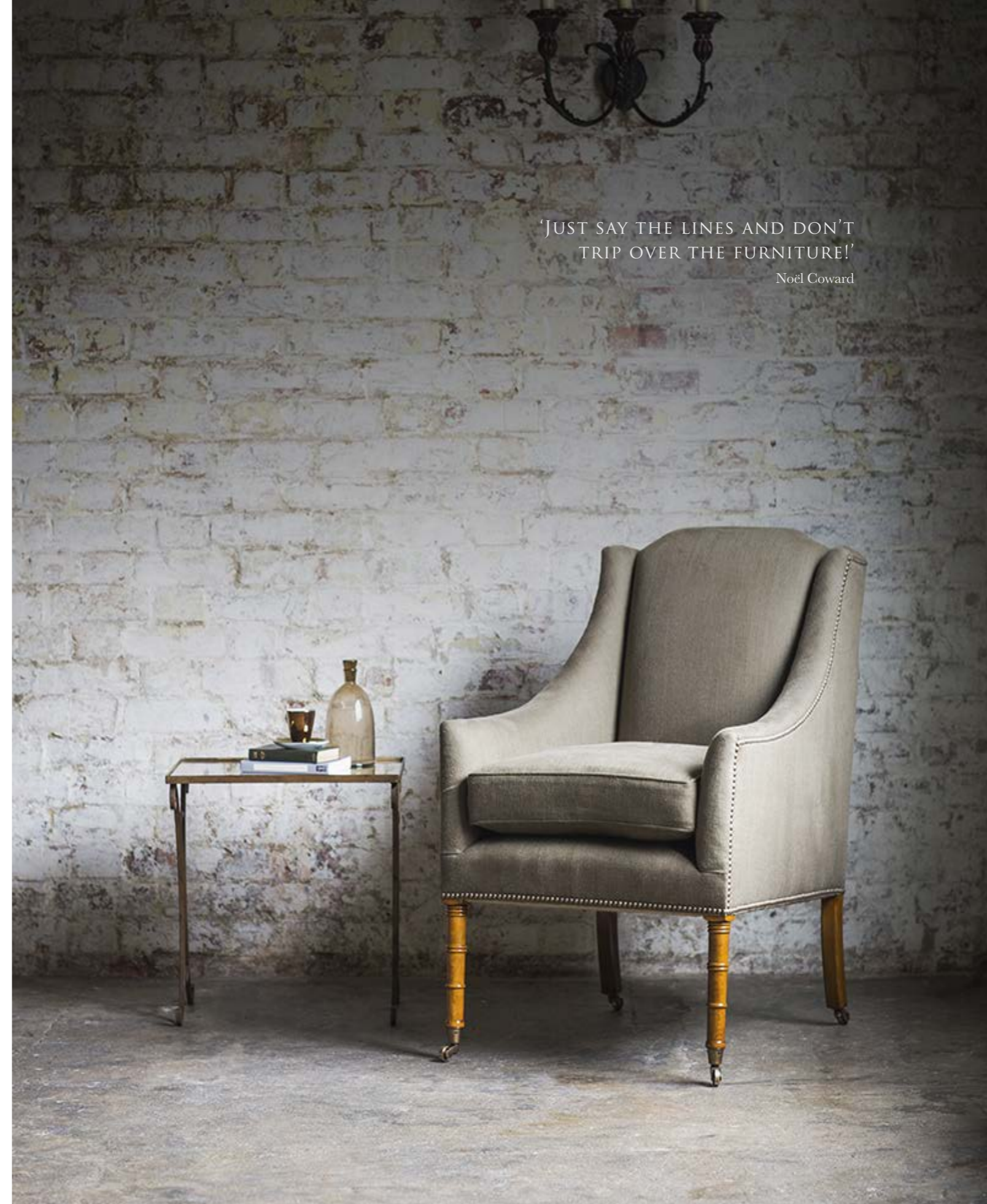
Opposite: Alexandra chair in Bantry linen - Hemp Green