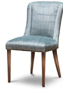
CALYPSO SIDE CHAIR

The partner to the Calypso carver chair has a matching design, but without the arms. See pages 54, 56.