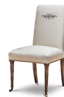
PAVILION SIDE CHAIR

As with its matching Pavilion carver, this side chair, with its clean lines and sophisticated finish, works effortlessly in any interior. See page 55.