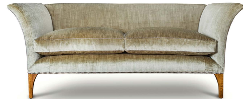
From top: Pompadour Low-Back sofa in Como silk velvet - Moss Pompadour High-Back sofa in Como silk velvet - Teal Warwick sofa in Como silk velvet - Fern