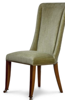
KINGSLEY SIDE CHAIR

For this partner to the Kingsley carver chair, we recreated the original design but omitted the arms. See page 54.