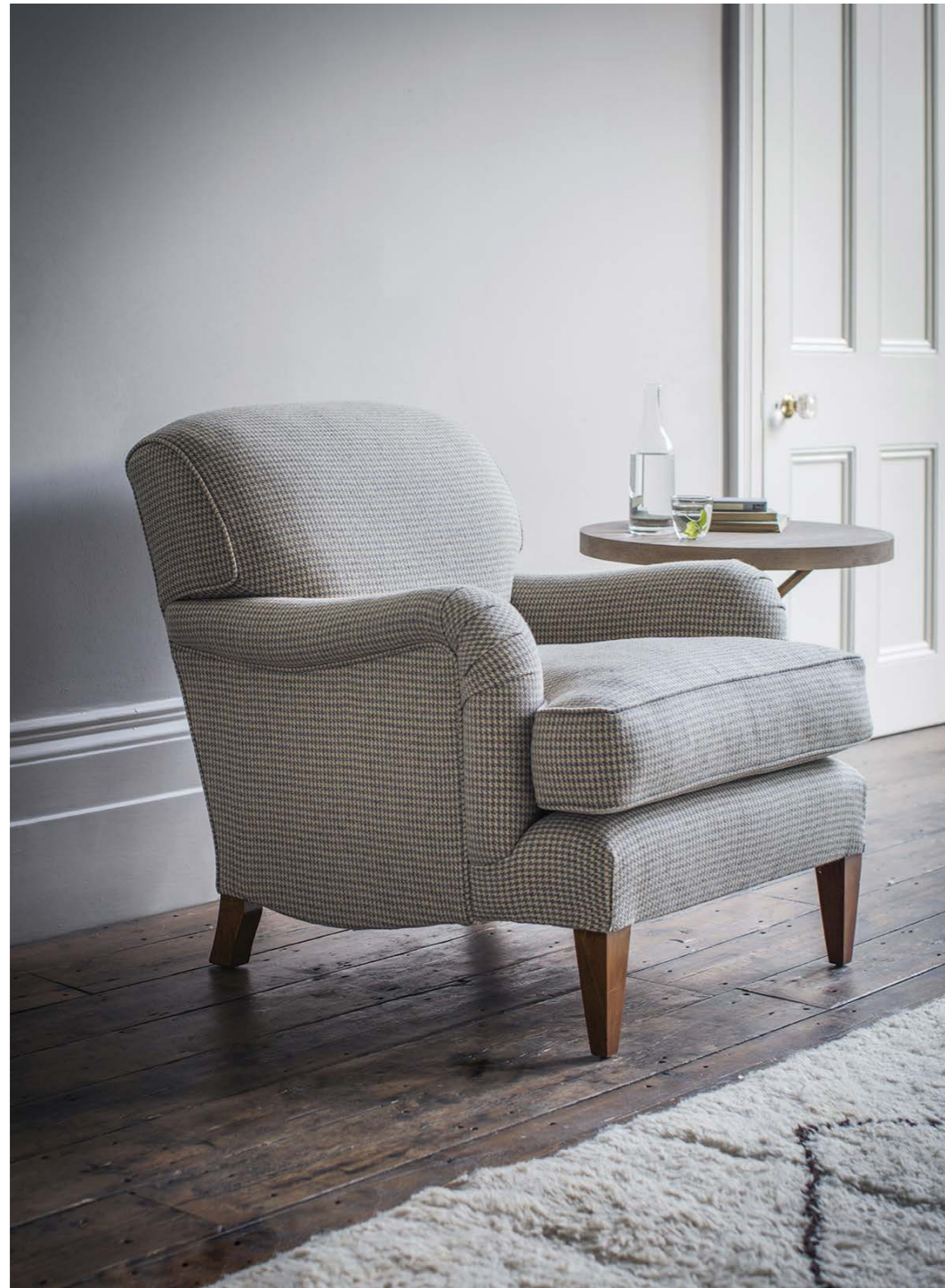
This page: Brooke chair in Argyll Check - Glacier