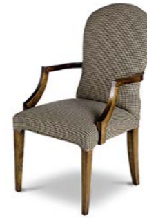
BLAKE CARVER CHAIR

This discreet but sophisticated dining chair is designed to offer comfort, as well as being a graceful addition to a dining table. See page 55.