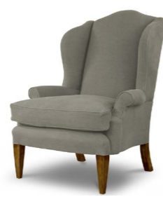
CLUB WING CHAIR

Practical in size and confident in design, the Club wing chair is a classically English piece of furniture. Shaped just like 18th-century prototypes, it gives excellent back support and comfort. See page 50.