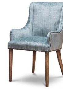
CALYPSO CARVER CHAIR

A brand-new design from Beaumont & Fletcher, the Calypso has a contemporary feel with impeccably aligned proportions. It's perfect as an occasional or dining chair.